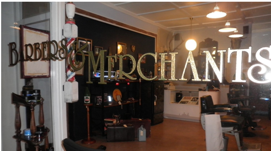
The B&M Shop.

"Looking for a new 'do', deciding if you should grow a beard, want to know how to buy a suit, are interested in women, cars, alcohol, self-defence and/or men's health"