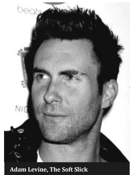
Adam Levine, The Soft Slick