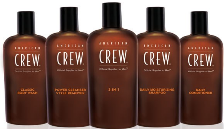
American Crew Hair and Body Range

You may also find that leaving conditioner out of your regular grooming repertoire could lead to an itchy or flaky scalp. So avoid or rectify this problem with the complimenting conditioner for your favourite salon shampoo!